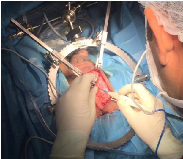
Bulbar Urethroplastic Surgery

Istanbul University Capa Med School - Urology Dept.